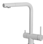
MGKT0U68 G68 8031873102890