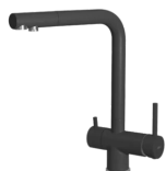
MGKT0U40 G40 8031873102876