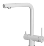
MKKT0U96 K96 8032557560821