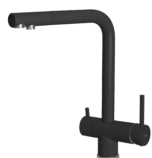
MKKT0U86 K86 8032557560814