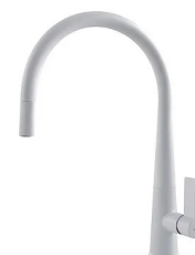
MGKATP68 G68 8031873104498