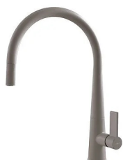
MGKATP43 G43 8031873104481