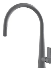
MGKATP48 G48 8031873104474