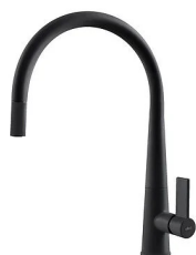
MGKATP40 G40 8031873104467