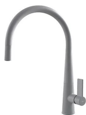
MMKATP79 M79 8031873551582