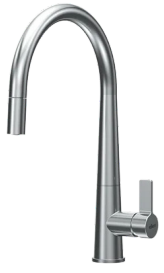
MIKATPCR CR 8031873651824