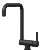
MGKDAN40 G40 8031873101831