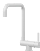
MGKDAN68 G68 8031873101824