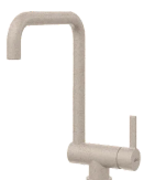
MGKDAN51 G51 8031873101817