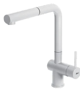
MKKSTP96 K96 8032557560227