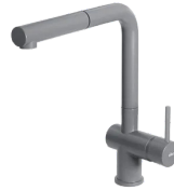
MGKSTP48 G48 8031873102104