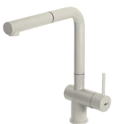
MGKSTP39 G39 8031873005047