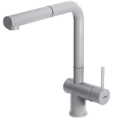
MMKSTP79 M79 8031873550868