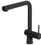
MGKSTP40 G40 8031873102821