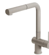
MKKSTP95 K95 8032557561514