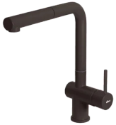
MGKSTP78 G78 8031873104511