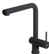
MGKSTP59 G59 8031873102159