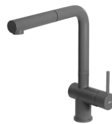
MKKSTP99 K99 8032557560791