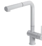
MGKSTP68 G68 8031873102838