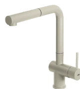
MGKSTP62 G62 8031873101787