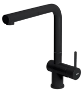
MKKSTP86 K86 8032557560210