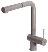
MGKSTP43 G43 8031873103637