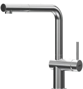
MIKSTPCR CR 8031873650759