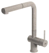
MGKSTP51 G51 8031873103798