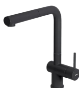
MGKSTP59 G59 8031873102159