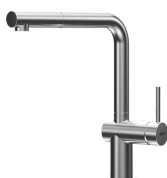
MIKSTPCR CR 8031873650759