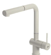
MGKSTP39 G39 8031873005047