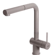
MGKSTP43 G43 8031873103637