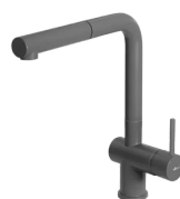
MKKSTP99 K99 8032557560791