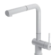
MGKSTP68 G68 8031873102838