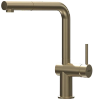
MOKSTPGD GD 8032557561965