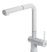
MKKSTP96 K96 8032557560227