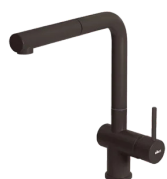
MGKSTP78 G78 8031873104511