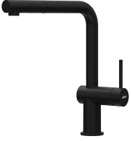
MOKSTPBK BK 8032557561958