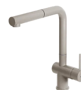
MKKSTP95 K95 8032557561514