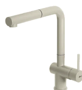
MGKSTP62 G62 8031873101787