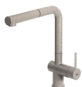
MGKSTP51 G51 8031873103798