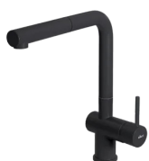
MGKSTP40 G40 8031873102821