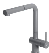
MGKSTP48 G48 8031873102104