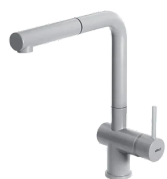
MMKSTP79 M79 8031873550868