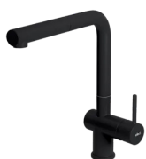
MKKSTP86 K86 8032557560210