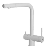
MGKTOU68 G68 8031873102890