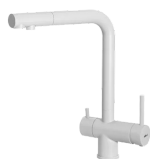
MKKTOU96 K96 8032557560821