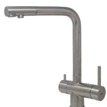
MIKTOUIN IN 8031873651374