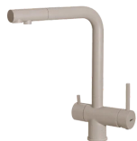
MGKTOU51 G51 8031873102883