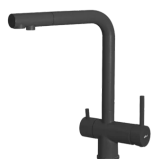
MGKTOU40 G40 8031873102876