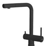
MKKTOU86 K86 8032557560814