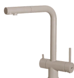
MGKTOP51 G51 8031873005078