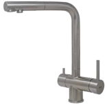
MIKTOPIN IN 8031873005092