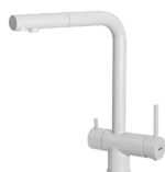
MKKTOP96 K96 8031873005115