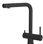
MKKTOP86 K86 8031873005108