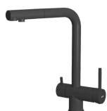
MGKTOP40 G40 8031873005061