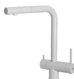
MGKTOP68 G68 8031873005085